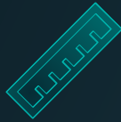
LONG CABLE RUN SOLUTION